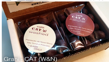
Grani - CAT (W&N)