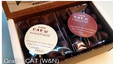
Grani - CAT (W&N)