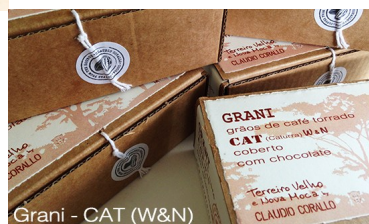
Grani - CAT (W&N)