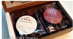
Grani - CAT (W&N)