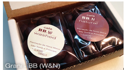
Grani - BB (W&N)