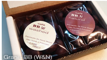
Grani - BB (W&N)