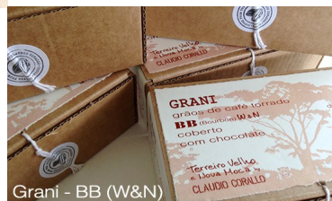
Grani - BB (W&N)